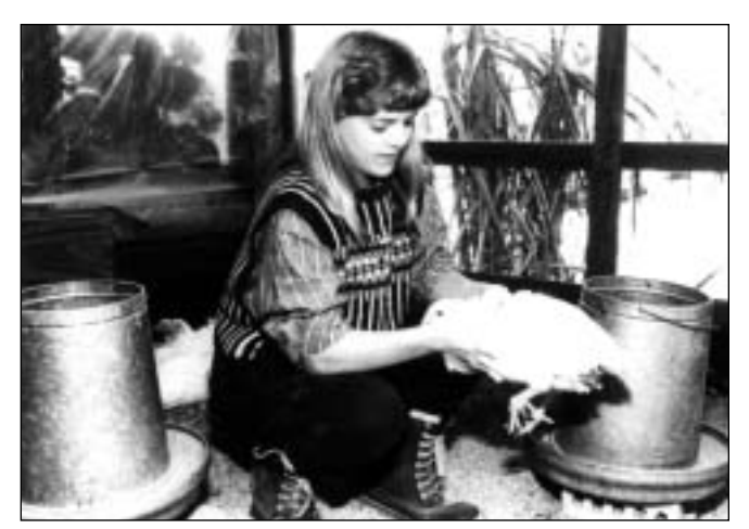
Handle birds carefully. Keep feeders and waterers level with the back height of the birds.

Snub the top beaks of birds if feather picking or cannibalism starts. Trim one-third of the upper beak with an electric beak snubber. Vicks<sup>®</sup> salve or an anti-peck compound applied to the bloody pecked