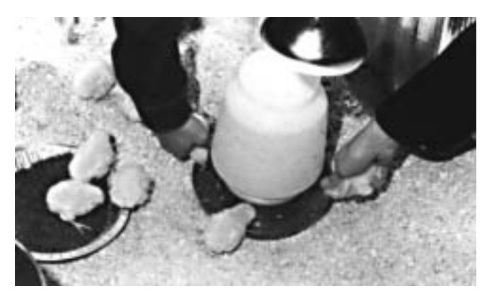
Water, feed and a heat source are all essential in getting chicks off to a good start.

Optimum performance is dependent on proper nutrition. The feed dealer should be informed of the type of feed required at least 2 weeks before chicks arrive so that fresh feed can be ordered. It is absolutely essential that birds receive a high-quality poultry