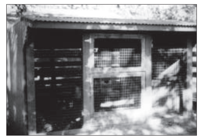
A typical building used for growing broilers or roasters for a youth project.

Be prepared for the chicks 2 days in advance. Put at least 4 inches of litter on the floor of the cleaned, disinfected house. Wood shavings, cane fiber, coarse