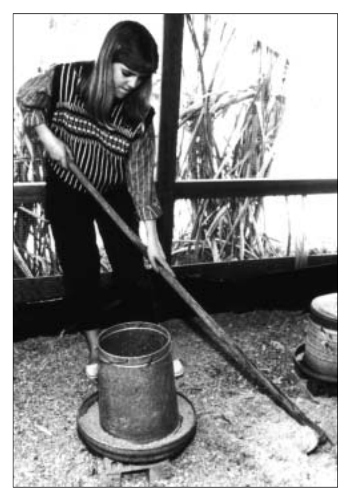
Stir the litter daily to prevent packing. Damp or caked litter will cause health problems and affect bird performance.

dry sawdust, peanut hulls or rice hulls make good litter. Hay makes very poor litter. Keep all sticks, boards and sharp objects away from the broiler house.