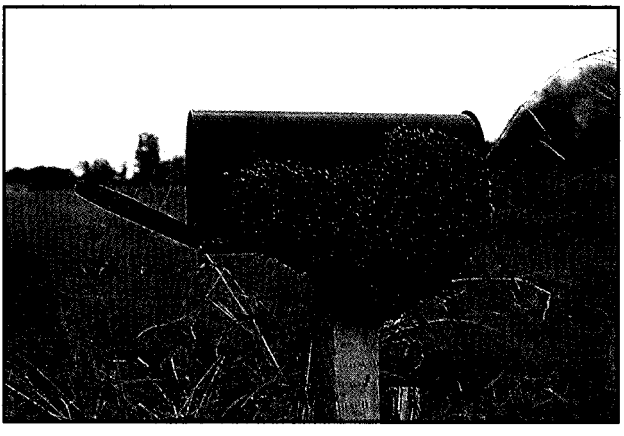
Swarm of honey bees

If you are going to work with honey bees it is important to wear protective clothing, especially a veil. Bees normally attack first around the face and eyes. Make certain the veil does not have holes and does not touch the skin. Other items include a hat loose fitting coveralls (if they are tight-fitting bees can sting through them), leather gloves and boots. When fully dressed you should not have any exposed skin, and any potential entry paths such as pants legs, pants pockets and shirt