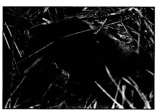
Honey bee nest with wax comb

in south Texas that is often mistaken fore the honey bee is the Mexican honey wasp or Mexican bee, Brachygastra mellifica . This species stores honey as honey bees do; however, it is smaller than a honey bee and its nest is made of paper-like material. The honey wasp is a very docile species and there is no need to remove its nest unless it is in a very sensitive area.